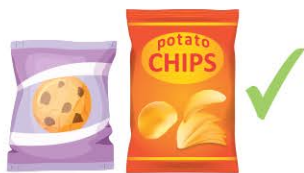
Small Snack Products