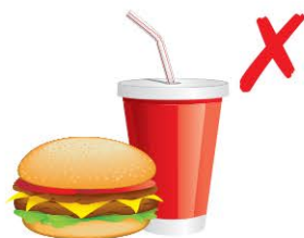
Fast Food (Commercially prepared food)