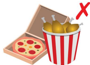
Bulk Food & Catering