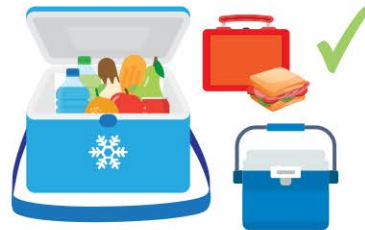
Small Cooler Bags & Small Eskys (Max. 25L)