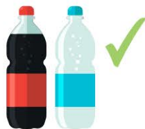
Drinks (Max. 600mL)