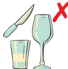
Glassware & Knives